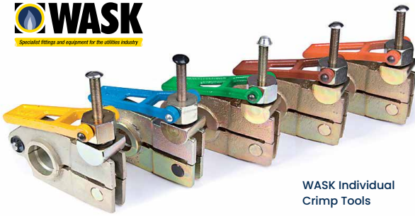
WASK Individual Crimp Tools