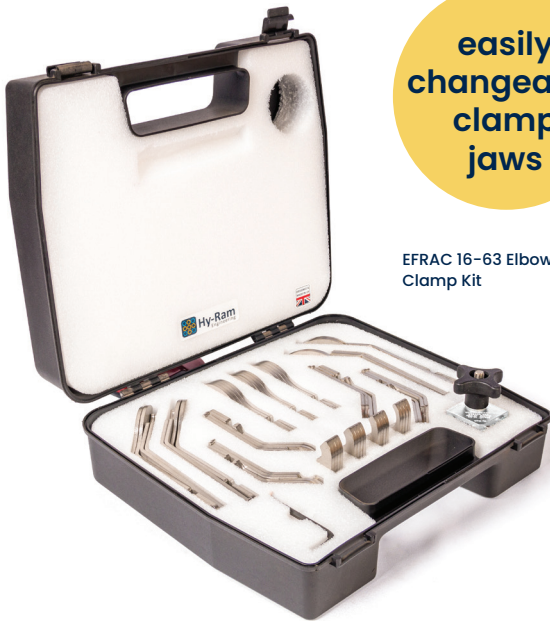
EFRAC 16-63 Elbow Clamp Kit

The Clamp is compact and has been designed specifically for use when connecting an Elbow to a Tapping Saddle, however it is also versatile for use in other electrofusion applications.