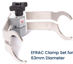
EFRAC Clamp Set for 63mm Diameter