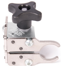
EFRAC Clamp Set for 32mm Diameter