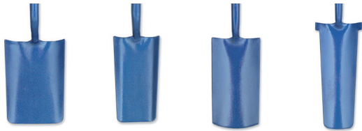
No0 GPO Trencher S/S Cable Layer S/S Clay Grafter 16" Newcastle Drainer