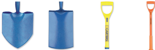
Treaded General Service Treaded S/S Spade Polyfibre PRO Shocksafe