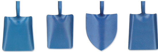
No.2 S/S Sq. Mouth No.2 S/S Taper Mouth No.2 S/S Round. Mouth No.000 S/S Sq. Mouth