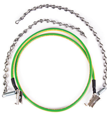
Continuity Band with End Chain