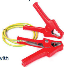
Continuity Band with HD Crocodile Clips

Temporary continuity bonds to be used when disconnecting or reconnecting pipework in circumstances where a spark could cause a hazard.