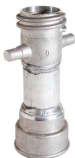
2 1/2" Standpipe Extensions